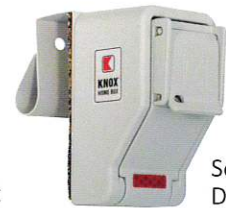
Security Door Hanger